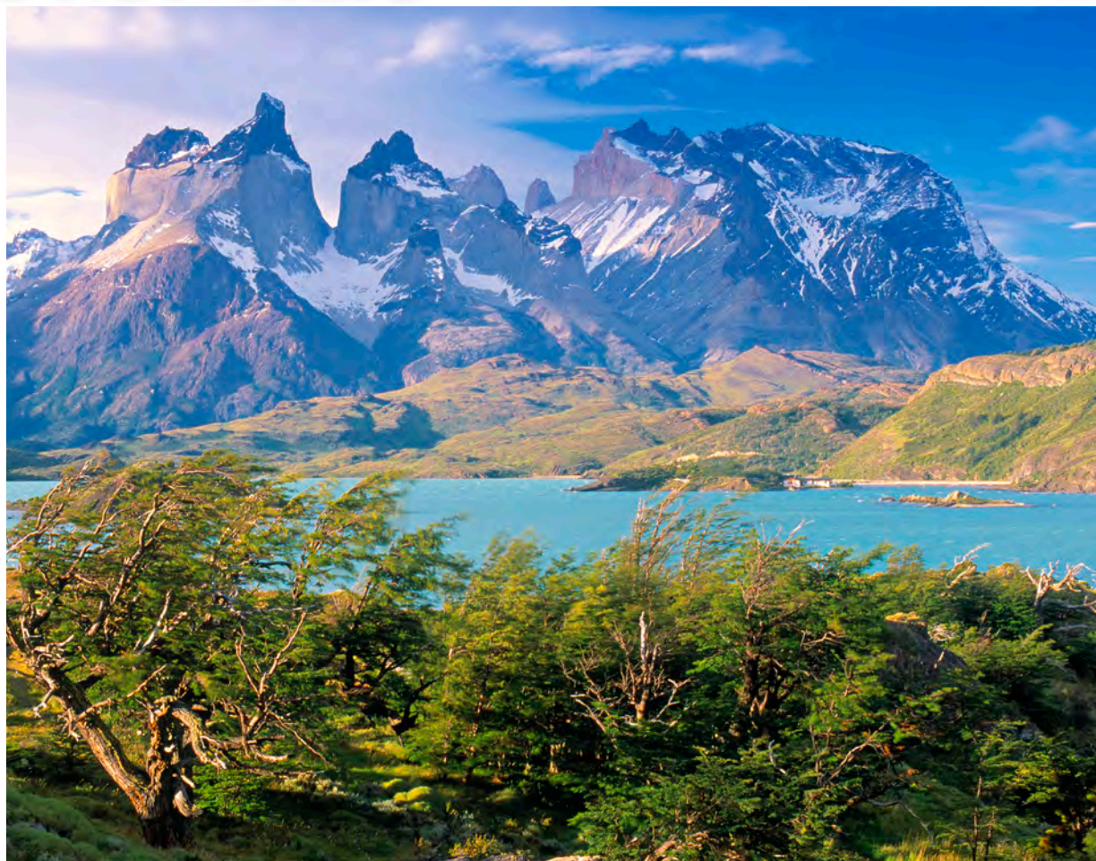
We spend two days exploring unspoiled Torres del Paine National Park.

Enjoy the rare privilege of face-to-face encounters with two of the world's last great frontiers: the majestic fjords and glaciers of Southern Patagonia, on a small-ship cruise; and the dramatic scenery of Torres del Paine on a three-night stay at the park. Along with visits to Buenos Aires and Santiago, we discover the remarkable diversity of South America.