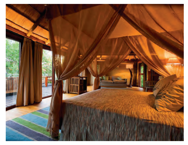
Nature surrounds the lodge's eco-friendly cabins.