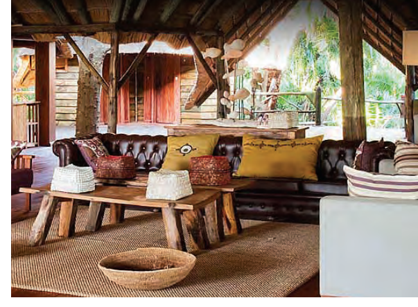
Sanctuary Saadani River Lodge, our luxury retreat Days 11–13