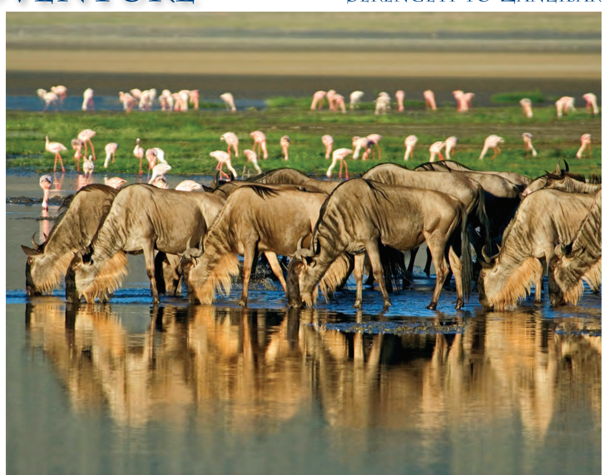
On Day 5 we visit Ngorongoro Crater, home to both Maasai tribespeople and a high concentration of wildlife - the only such place on Earth.

Ratings are based on the Hotel & Travel Index, the travel industry standard reference.