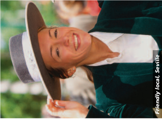
Friendly local, Seville

Join alumni and friends for this unique land and sea experience!