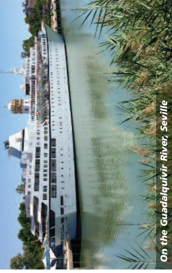
On the Guadalquivir River, Seville

Embark on a voyage of discovery aboard the elegant MV Aegean Odyssey . Immerse yourself in the history, art and architecture of classical civilizations.