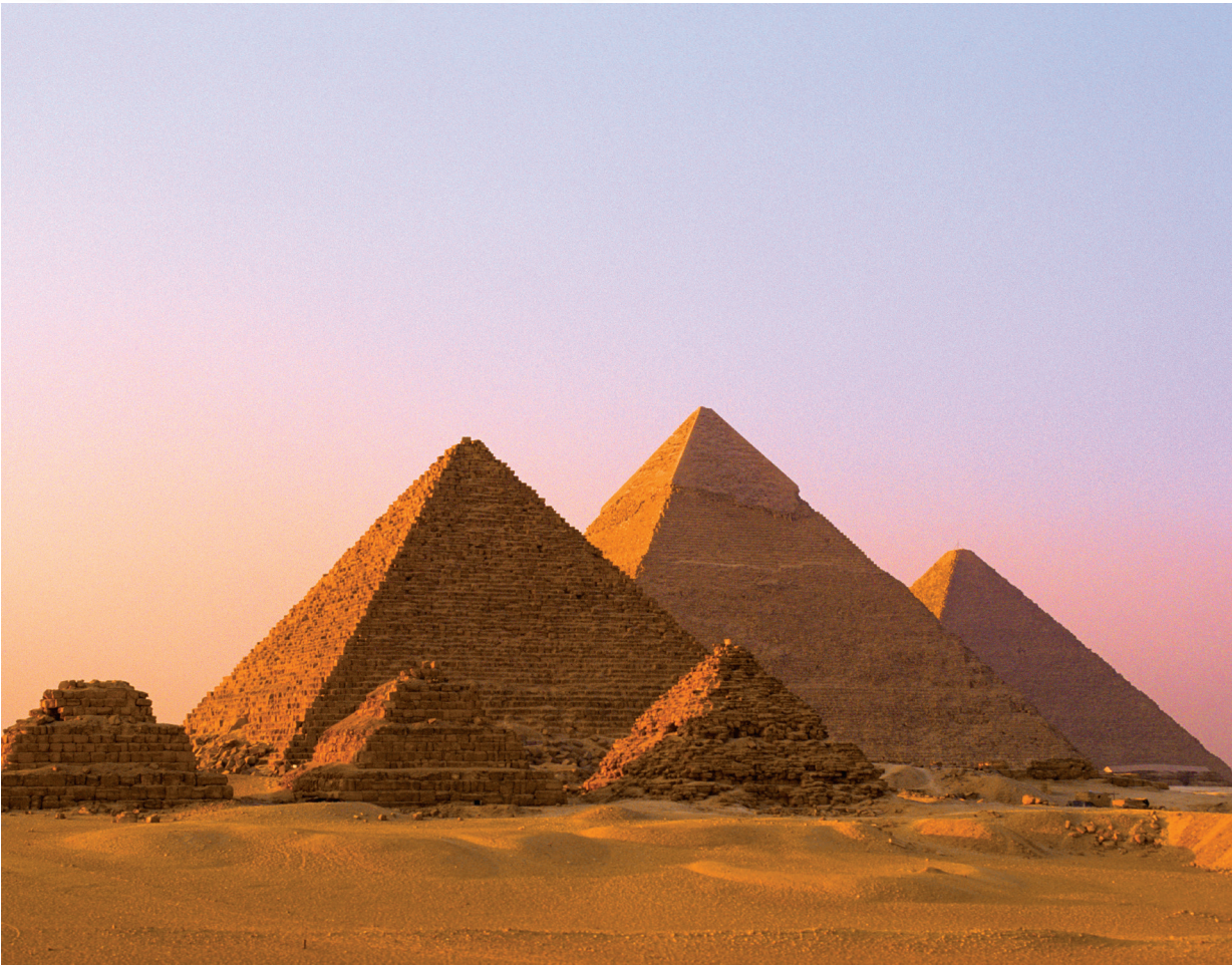
On Day 4 we travel to the Giza plateau to see the legendary pyramids, built 5,000 years ago as royal tombs.

Ratings are based on the Hotel & Travel Index, the travel industry standard reference.