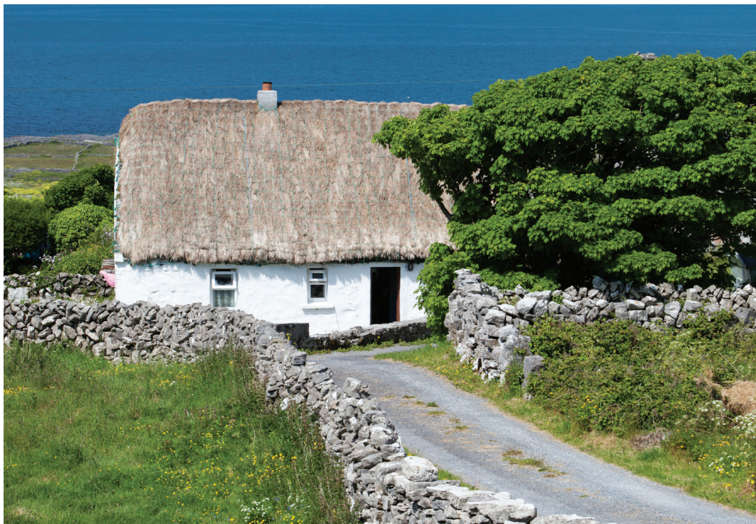
Aran Island scene

history has been an inspiration to artists, writers, and filmmakers. Sitting across Galway Bay in the midst of the Atlantic, the islands feature primitive stone forests, early Christian churches, and medieval castles – as well as shops, galleries, and restaurants. An islander guides our tour here, imparting local lore along the way. We stop at Dun Aenghus Fortress, the three prehistoric stone walls crowning the tallest cliffs of Inismor; have lunch in a local pub; and enjoy some free time before returning to the mainland and our hotel late this afternoon. Dinner tonight is at a local restaurant in the village of Bearna. B,L,D