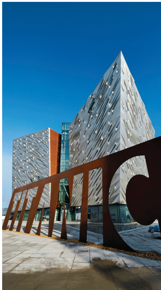
Titanic Museum, optional extension

Day 13: Depart for U.S. We leave this morning for the Dublin airport and our return flights to the United States. B