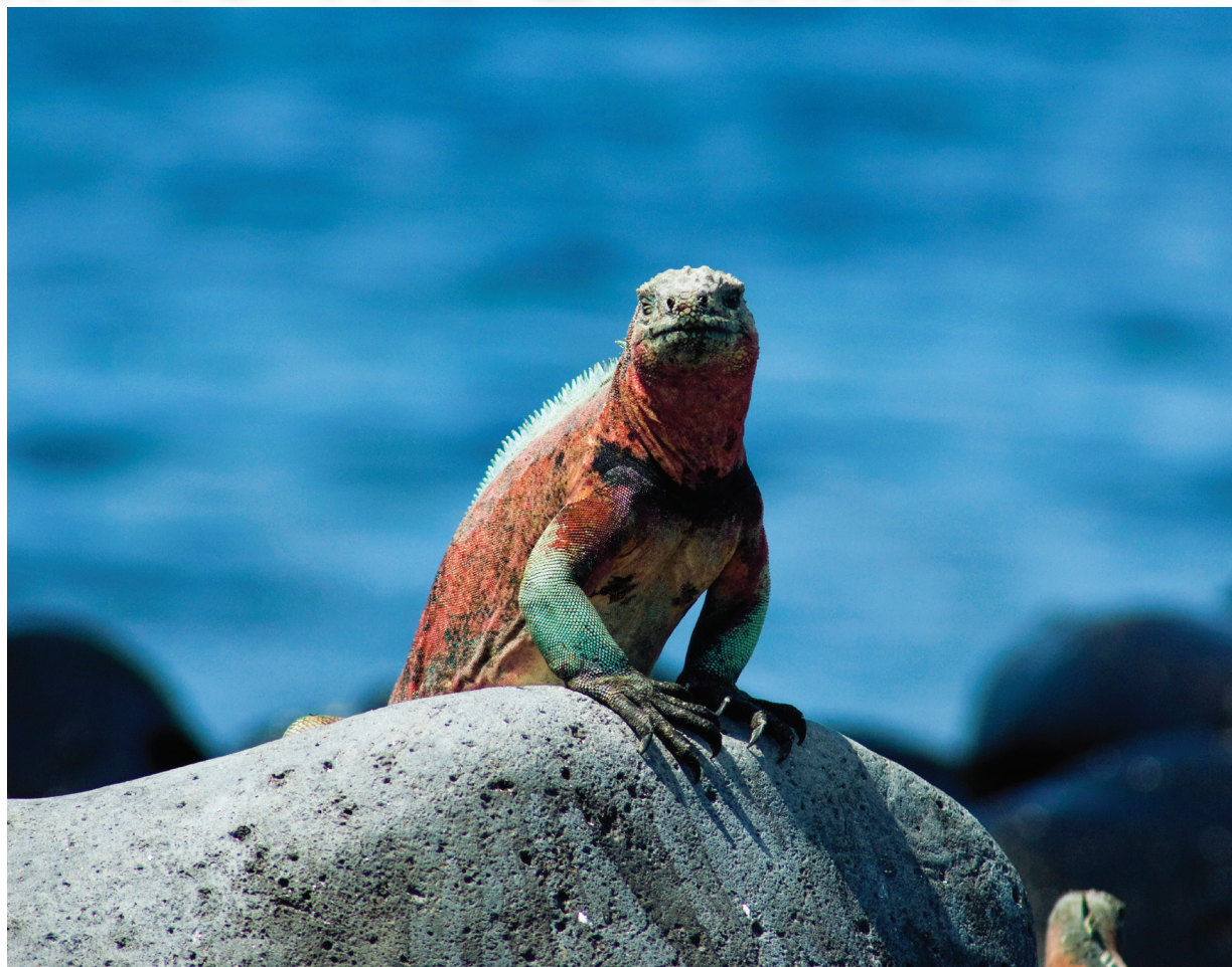
We're sure to encounter plenty of wildlife in the Galapagos, like this curious iguana.