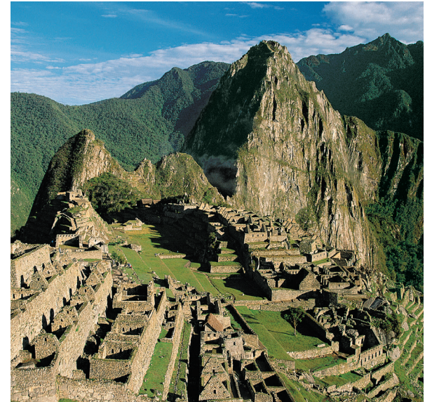
We explore the amazing ruins at Machu Picchu on Days 5 & 6.

Day 15: Depart for U.S. We transfer to the airport this morning for our return flights to the U.S. B