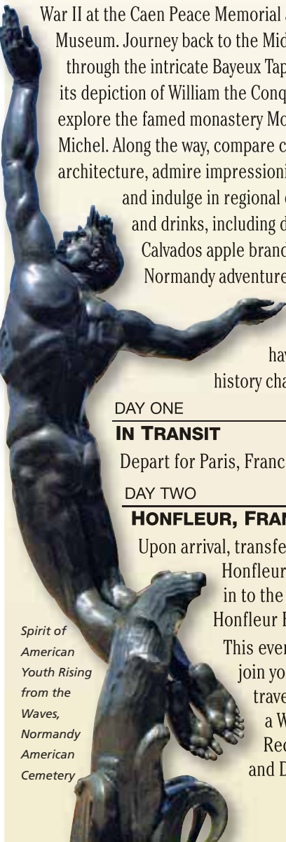
Spirit of American Youth Rising from the Waves, Normandy American Cemetery

Excursion: Le Mont Saint-Michel. With one glimpse of Mont Saint-Michel's silhouette rising above the flat, white sands that surround the granite outcrop where the sanctuary church sits, you'll know why this UNESCO World Heritage