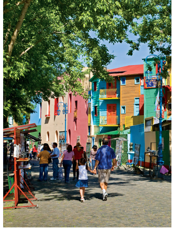
We visit Buenos Aires' colorful La Boca district on Day 3.