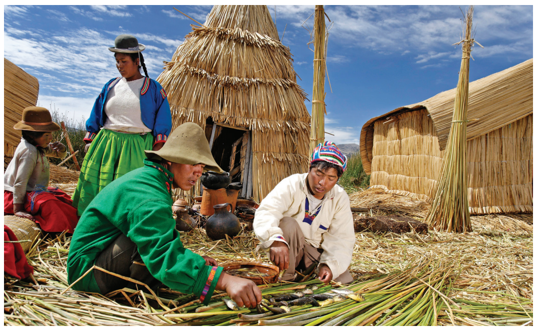
Uros Island residents weaving reeds in the traditional manner

after lunch we board a bus for Machu Picchu and our first guided visit of the stunning "Lost City of the Incas." Thanks to its small size, our group will move nimbly through the ruins and have the leisure to absorb the beauty and mystery of this haunting UNESCO World Heritage site. Midafternoon we return to Aguas Calientes and our hotel, with time at leisure before dinner together tonight. B,L,D