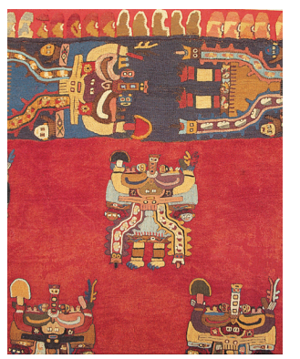
Traditional Peruvian fabric

highest navigable lakes. Up here the air is clearer, the colors sharper, and the horizon farther. By boat we visit the Floating Island of Los Uros, where the top-hatted Uros people live on "islands" made of the reeds that grow in the lake's shallows; in fact, the Uros rely on these reeds for their boats, the small huts in which they live, household items, and the handcrafts they sell to visitors. We also visit Isla Taquile, known for the high quality textiles crafted by the indigenous people who live here; sales of their textiles support the self-sustaining Taquilenos. On our