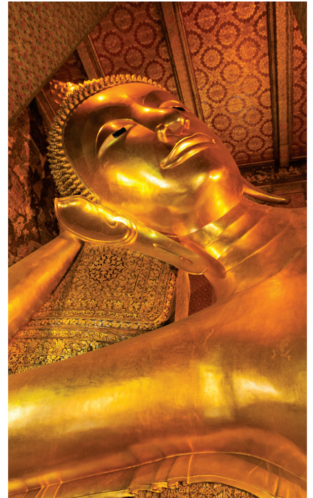
We see the Reclining Buddha at Wat Pho, Bangkok.