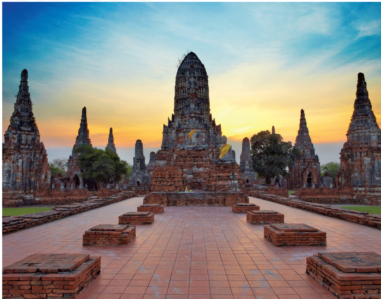
We explore the ruins of the once-grand city of Ayutthaya, now a UNESCO site, on Day 4.