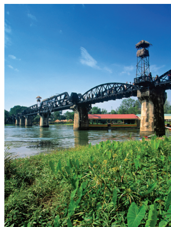
The bridge over the River Kwai

Day 9: Chiang Rai Today we tour the infamous Golden Triangle, where the Ruak and Mekong rivers meet, and where from a hilltop we can see views of Thailand, Myanmar (Burma), and Laos. Later we enjoy a leisurely boat ride along the Mekong. We take a scenic drive along narrow mountain roads to visit