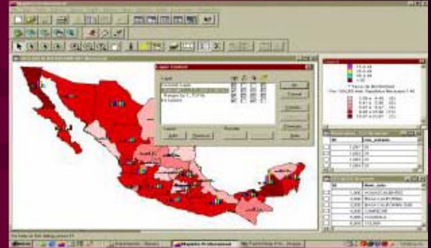
State and municipal cartography