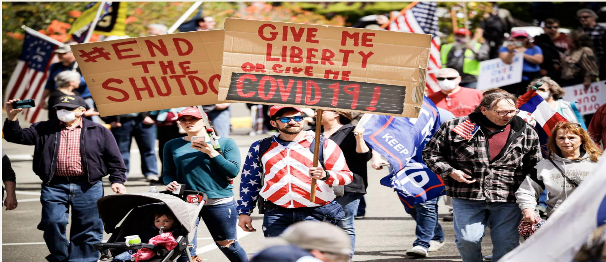
Picture from Vox: America doesn't want another Tea Party: Don't let Fox News fool you. 81% of Americans do not share the views of anti-quarantine protesters. April 20, 2020. https://www.vox.com/2020/4/20/21225016/protests-stay-at-home-orders-trump-conservative-group-michigan

What social values should guide us in reopening the nation?