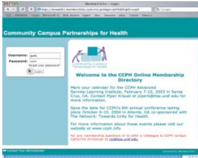
Directory login screen found at http://my.memberclicks.com/ccph

CCPH has an online membership directory that is exclusively for use by members. In your orientation packet you received your unique username and password so that you can log onto the directory. The directory offers many powerful advantages, including a searchable database to allow members to locate other members in their area, in their discipline or by other searchable, relevant criteria. The directory is password protected in order to ensure the privacy of information. CCPH members and staff are the only people allowed unrestricted access.