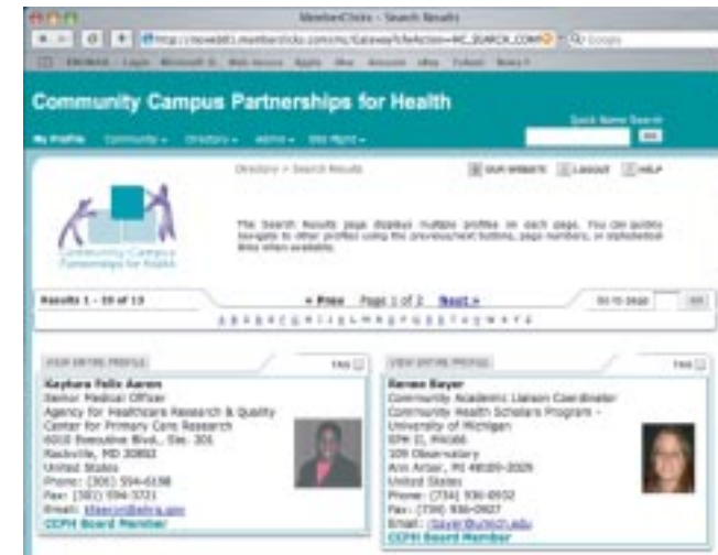
Sample of Directory search results