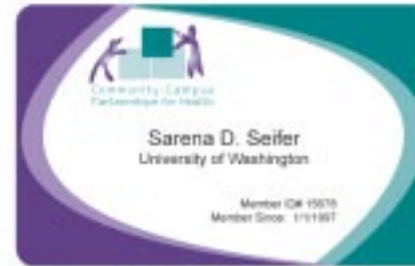
Sample of a CCPH Membership ID Card

All new members receive a membership card in their orientation packet. Your membership card includes your membership ID# for quick reference. CCPH uses membership identification numbers to make taking advantage of our membership services and benefits as easy as possible. Membership identification numbers help us quickly verify active memberships and allow us to instantly provide you access to discounts on conference and event registrations, discounts on our publications, plus much more! Please reference your membership ID# when consuming CCPH membership benefits and services. For those enrolled through an Organizational Membership, the membership ID# is the same for all enrolled on that membership.