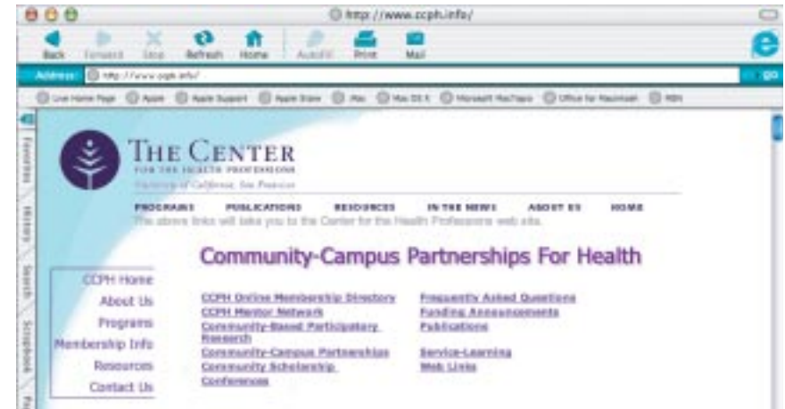
CCPH Resources Webpage