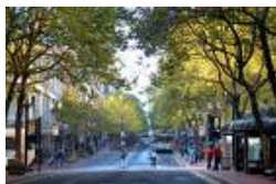
Tree-lined streets of downtown Portland