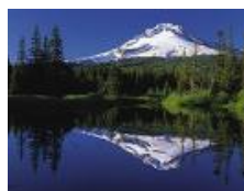
Mount Hood, which overlooks the city of Portland