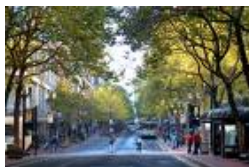
Tree-lined streets of downtown Portland