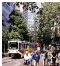
Portland's mass transit system: The Max

Sign on as conference cosponsoring, exhibiting or supporting organization NOW! The conference cosponsor/exhibitor prospectus will be posted on our website shortly. Supporting organizations provide in-kind support for the conference. This can include, for example: * Announce the conference in your newsletter and on your website. * Create a link from your website to ours at http://www.ccpb.info * Distribute information about the conference at meetings and other events. * Send us e-mail addresses for relevant contacts and we will send them invitations to the conference.