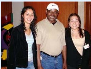
Past CCPH Conference Participants