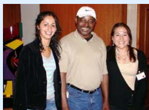
Past CCPH Conference Participants