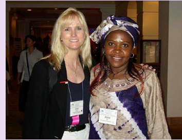
Past CCPH Conference Participants