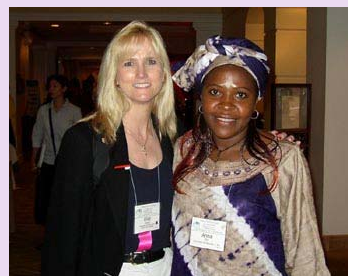
Past CCPH Conference Participants