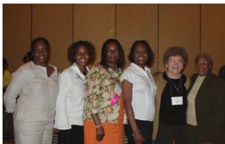
CCPH Conference Participants

This year’s conference program is available at http://depts.washington.edu/ccph/conf-agenda.html