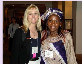
Past CCPH Conference Participants