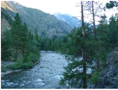
The Cascade Mountains of Washington State are an ideal retreat setting for reflective learning

These goals have remained central to CCPH's mission of promoting health (broadly defined) through partnerships between communities and higher educational institutions. Our summer service-learning institute, in its 9 th year, has helped to nurture the growth of service-learning in the health professions. Mentors and participants at this summer's institute, listed below, demonstrate the diversity of academic institutions, professions and community organizations involved in service-learning. To bring a customized version of the institute to your campus or community, visit