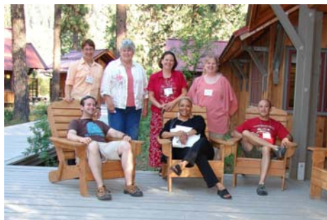
Participants leave the institute with a peer group for continued learning and support

http://depts.washington.edu/ccph/faq.html#Listservs