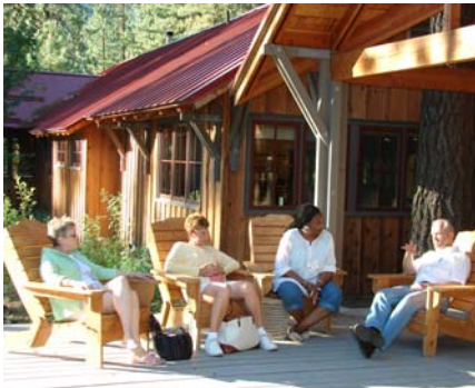
Small group mentoring sessions are a central feature of the institute