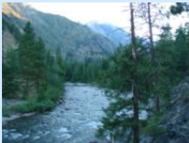
The Cascade Mountains of Washington State are an ideal retreat setting for reflective learning