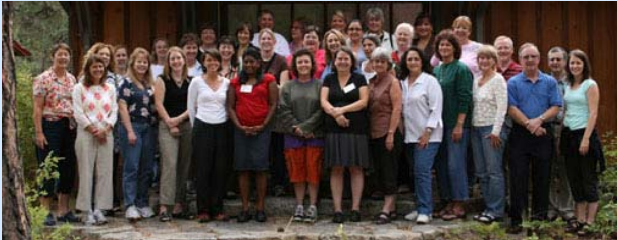
Participants, Mentors and CCPH staff at the 2007 CCPH Summer Service-Learning Institute