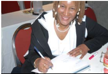
Participant from this year's CCPH Conference

"The CCPH was truly a wonderful experience and I networked with so many individuals. The best conference I have attended!"