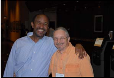
Participants from this year's CCPH Conference

We hope you are already planning to participate in the conference! CCPH conferences are noted for their emphasis on inclusion, experiential learning and subsequent action. The conference is designed to encourage active participation by all participants through a variety of session formats, including skill-building workshops, story sessions, thematic posters, community site visits, exhibits, and peer and interest group meetings. The conference also features many opportunities for informal conversation and networking.