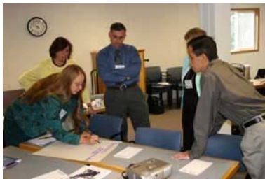
World Cafe brainstorming exercise in Medford

The workshops' training material was based on the " Developing and Sustaining Community-Based Participatory Research Partnerships " curriculum written by the Community-Institutional Partnerships for Prevention Research Group (composed of CCPH and 9 other project partners). Beginning with an introduction to the CBPR approach to research, participants learned about the key elements in developing and sustaining these partnerships, broken down into four topics: (1) identifying and selecting partners, setting priorities, building trust and communication, (2) setting up infrastructure/tools and strategies to support the partnership, (3) addressing funding and sustainability issues, and (4) conducting participatory evaluation.