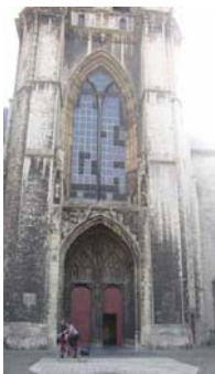
Cathedral in Ghent

By attending The Network:TUFH's conference I was able to meet people from all over the world and learn about the incredible work that they are doing. As an exhibitor, I was also able to educate participants on CCPH's many activities and recruit new members for CCPH's member network. A benefit of being a member of CCPH is that you have the opportunity to network with people from all over the world involved in community-campus partnerships through CCPH's members-only online directory at http://depts.washington.edu/ccph/members.html#ForMembersOnly