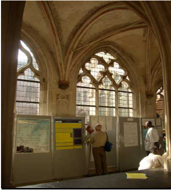
Exhibit & Poster Hall

The Network: TUFH's next International Conference, "Human Resources for Health: Recruitment, Education and Retention" will take place September 15-20, 2007 in Kampala, Uganda, in cooperation with the Faculty of Medicine at Makerere University. For more information, visit http://www.the-networktufh.org/conference/