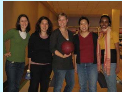
CCPH staff holiday party

Partnership Matters newsletter is a member benefit of Community-Campus Partnerships for Health