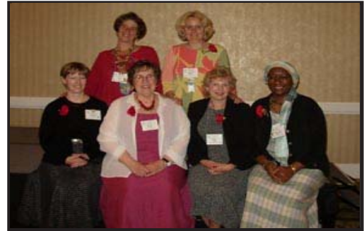
Representatives from the Center Health Communities in Dayton Ohio accept the 2nd Annual CCPH Award on behalf of their partnership

Edited transcripts of all conference plenary sessions and a selected group of workshop sessions will appear in the 2003 issue of CCPH's magazine Partnership Perspectives. Related resources are available on the CCPH website at http://futurehealth.ucsf.edu/ccph/links.html#CommPart , http://futurehealth.ucsf.edu/ccph/links.html#Engaged and http://futurehealth.ucsf.edu/ccph/partnerships.html#Tools