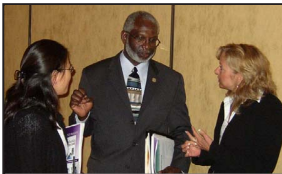
Dr. Satcher talks with CCPH conference participants after his keynote speech