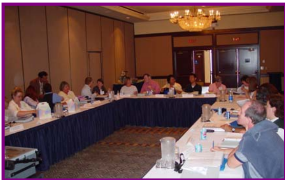
CCPH sponsored the service-learning institute with California State University Chancellor's Office

What lessons would you add to this list? Share your ideas and reflections with us by emailing ccphuw@u.washington.edu .