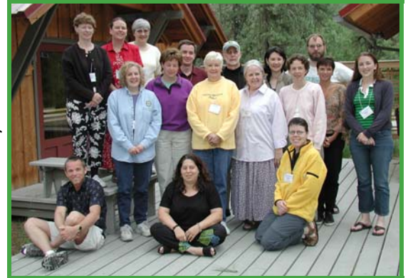
CCPH Introductory Service-Learning Institute participants in Leavenworth, WA June 15-18, 2002

*Curricula based on principles of adult learning can be effective in stimulating and supporting change. The institutes offered this month incorporated many experiential learning methods: case-based learning, role playing, group problem-solving, written reflective exercises. How might you build such methods into your service-learning courses, faculty development workshops, partnership advisory board meetings, and so forth?