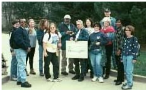
CCPH board of directors and staff with our West Virginia members at the September board retreat in Charleston, WV.

institutions that build on each other's strengths and develop their roles as change agents for improving health professions education, civic responsibility and the overall health of communities.