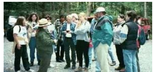
Information session on poisonous snakes and plants with the New River Gorge ranger before the hike!