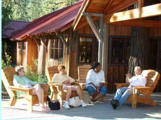
The Sleeping Lady Retreat Center is an ideal site for reflective learning.