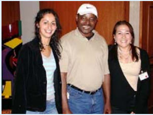
Past CCPH Conference Participants