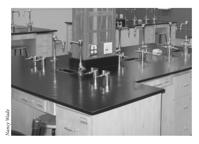
Bagley Hall freshman laboratory, 2007