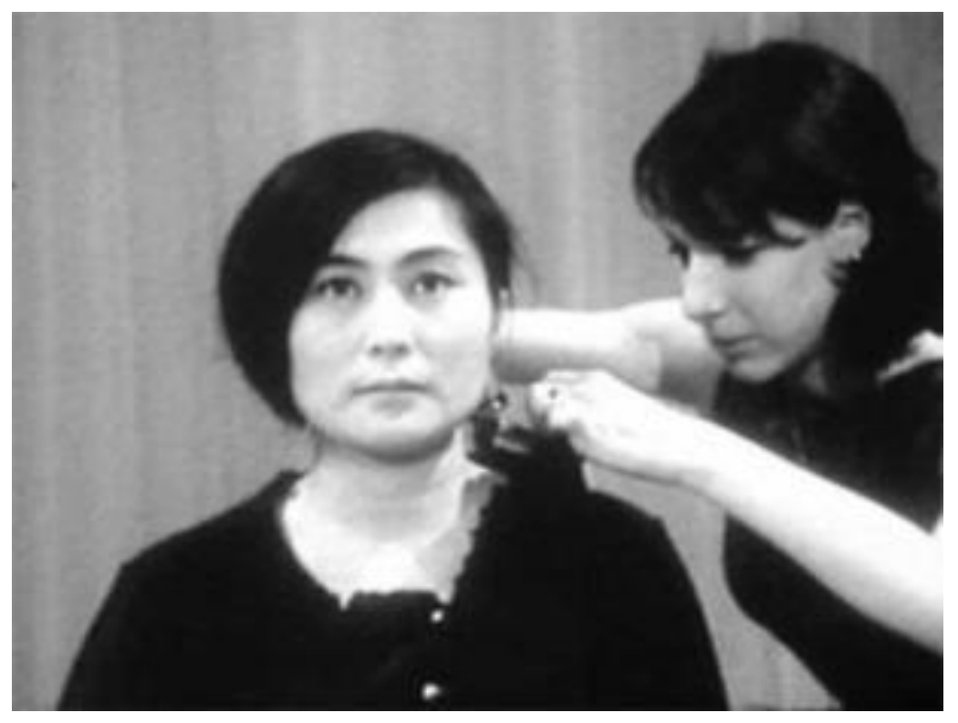
Yoko One, Cut Piece.