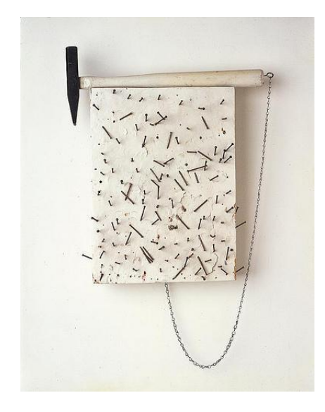
Yoko Ono, Painting to Hammer a Nail, 1961/66. Painted wood panel, nails, painted hammer, chain.

is about conceptual destruction of both the material surroundings and the self, and like Painting to Hammer a Nail , the creation of art is possible through the destructive act.