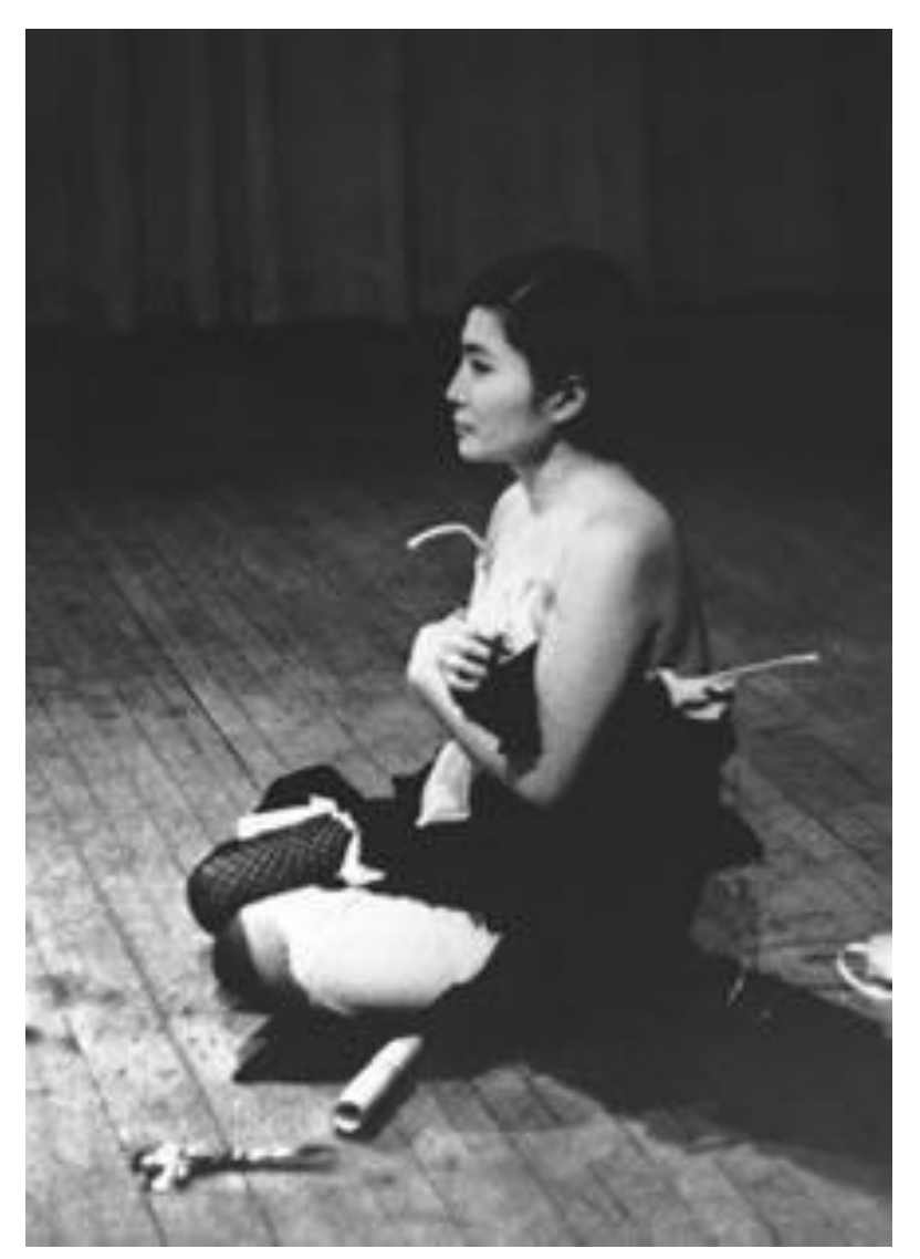
Yoko Ono, Cut Piece. Performance, Carnegie Recital Hall, 1965.

Ono further investigates the topic of violence against women in her film Rape (1969), in which she collaborates with Lennon. For seventy-seven minutes, the camera relentlessly follows a young woman through town, down an alley, and eventually to her own home. The film powerfully depicts a constant chase and intrusion, a violation of privacy as the woman becomes increasingly upset and paranoid. Though rape is not depicted literally, the implication of social control over women's lives is evident in the intensity of the chase and the visible fear of the woman. In her anthology of instructions Grapefruit , Ono addresses her film,