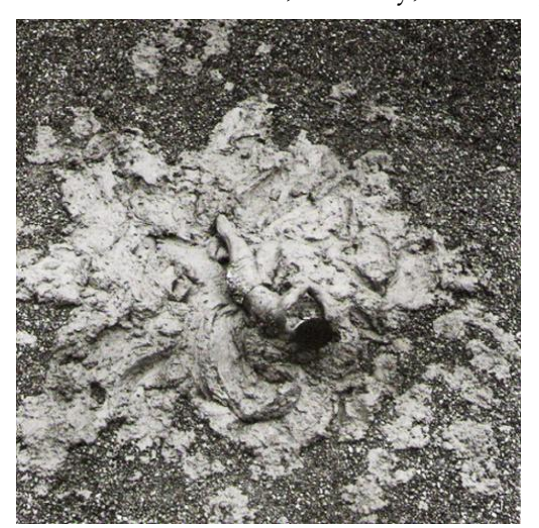
Kazuo Shiraga, Challenging Mud , 1955. Ashiya City Museum of Art History, Japan.