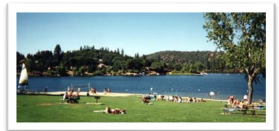
Pine Mountain Lake

The historic gold rush town of Groveland is small and friendly, yet it is complete with a grocery store, pharmacy, library/museum, medical clinic, youth center and a variety of restaurants, hotels and shops. You will find churches of many denominations and a variety of service groups. Groveland's Tenaya Elementary School covers grades K-8 and Tioga High School is grades 9-12. The Groveland's Yosemite Chamber of Commerce website is a great resource for local information and community events.