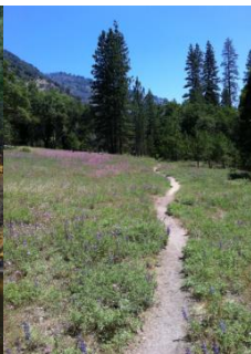
Preston Falls Trail