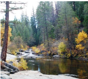
Carlson Picnic Area

Submission of this form is voluntary--Thank you for your interest in our vacancy!