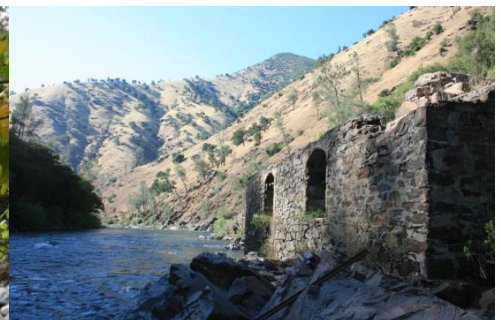
Historic Powerhouse on the Tuolumne River