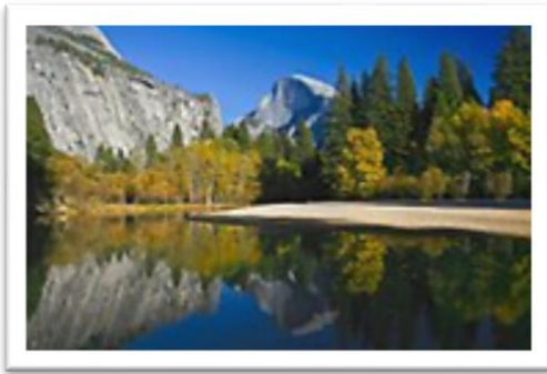
Yosemite National Park

Sonora is the largest full-service community within commuting distance of Groveland. Sonora is the county seat for Tuolumne County . The Tuolumne County Chamber of Commerce website is quite informative.