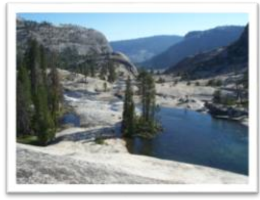
Cherry Creek - Emigrant Wilderness

The Groveland Ranger District office is located Highway 120 eight miles east of the town Groveland of and fifteen miles west of Big the Oak Flat entrance to