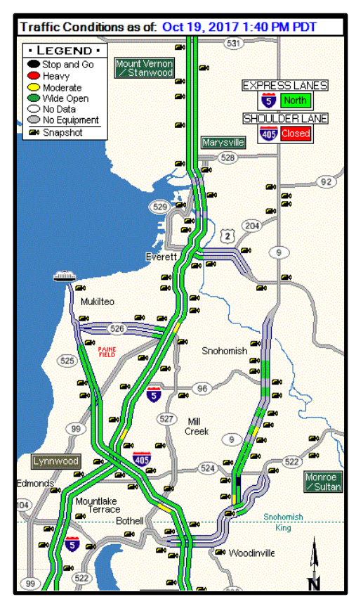
Figure 2: Regional Map from WSDOT Interactive website for traffic mapping

Today, this early research has evolved into an interactive website that displays maps of regions across the state with traffic information layered onto mapping tools. In addition to freeway sensors, these maps incorporate a vast array of closed circuit television (CCTV) cameras that users can select and view. The maps also show congestion, construction, traffic incidents and other variables, allowing users to construct a rich view of the traffic situation in any area at any time (see Figure 2 below). ("Seattle Area Traffic," n.d.)