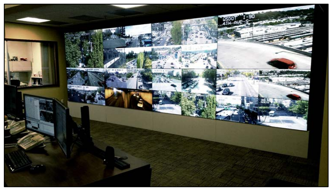
Figure 4: SDOT Transportation Operations Center

providers), and is transmitted to a computer located in the field (i.e. at an intersection) or to the TOC for processing and related action. ("Technology Program," n.d.) Some of the beneficial components of the SDOT ITS include: (a) portable changeable action signs, (b) dynamic messaging signs, (c) traveler information website, (d) SDOT twitter, (e) traffic signal management, (f) transit signal priority and more. The sections below provide a brief overview of some of the SDOT technological components most relevant to TIM-CM.