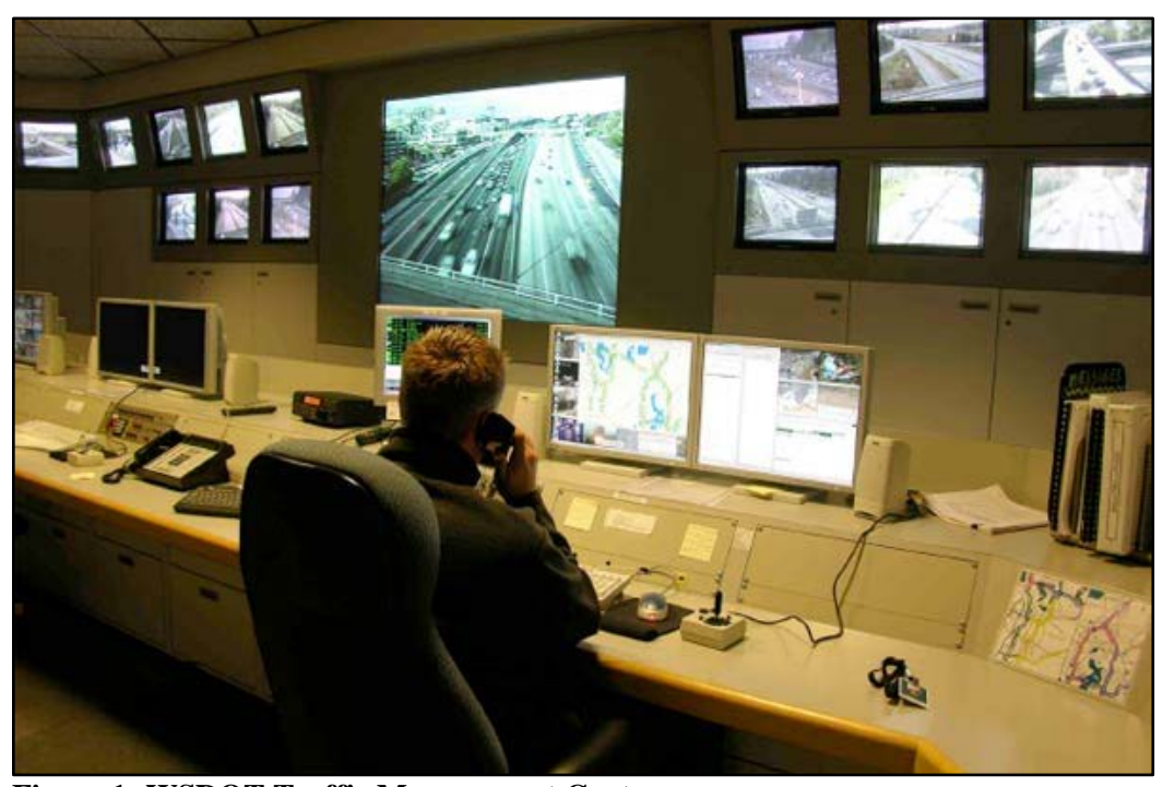
Figure 1: WSDOT Traffic Management Center

WSDOT maintains six TMCs located around the state (Shoreline, Tacoma, Vancouver, Wenatchee, Yakima and Spokane) with a winter operations center on Snoqualmie Pass. These centers are the backbone for information management crucial to State transportation operations, including incident management. ("Traffic Management Centers," 2016) TMC personnel are key stakeholders in this TIM-CM project.