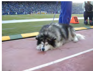
We are "Dawg" friendly!