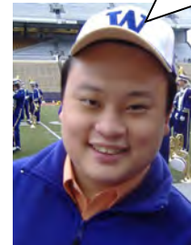
You might even meet somebody famous!