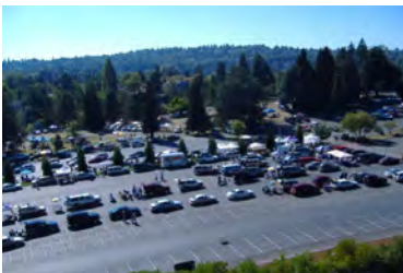
We have our own parking lot!