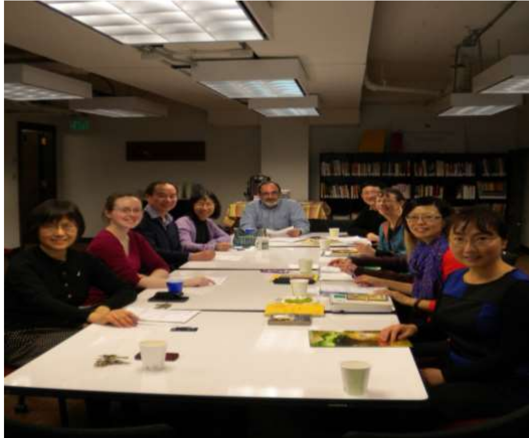
UW-UBC CLIR Team meeting during a day trip of UBC Team to UW On Feb 4, 2015