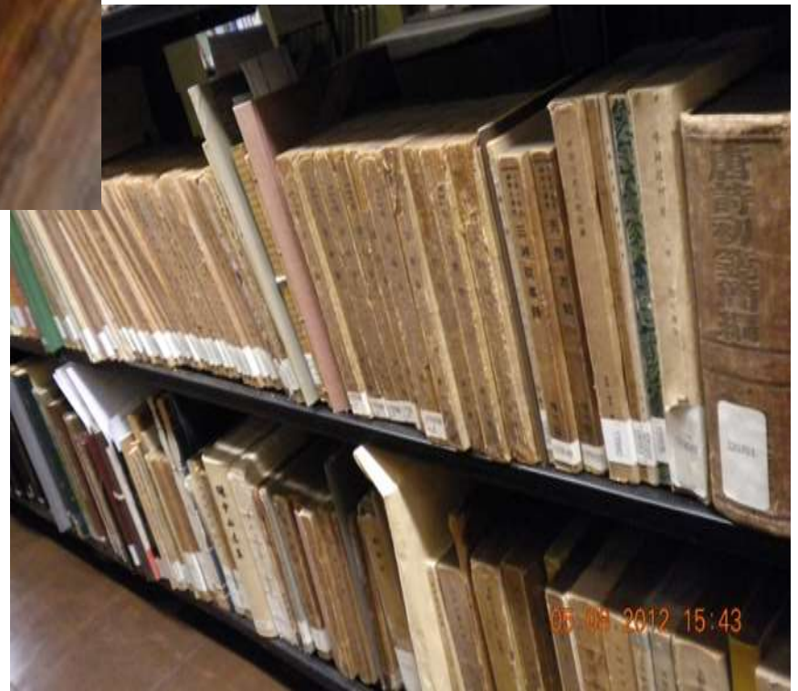
Chinese Republican Era Publications →