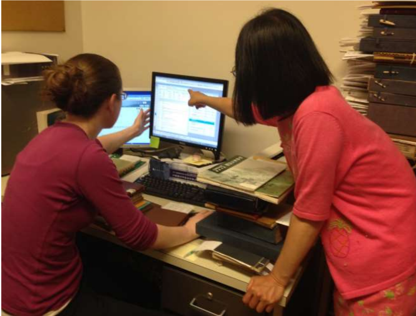
Staff training for CLIR project