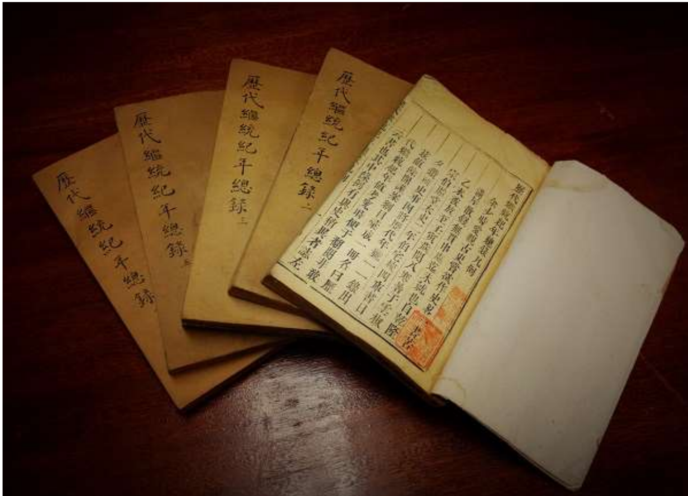
Dynastic Annals, printed in 1796. Only copy existing