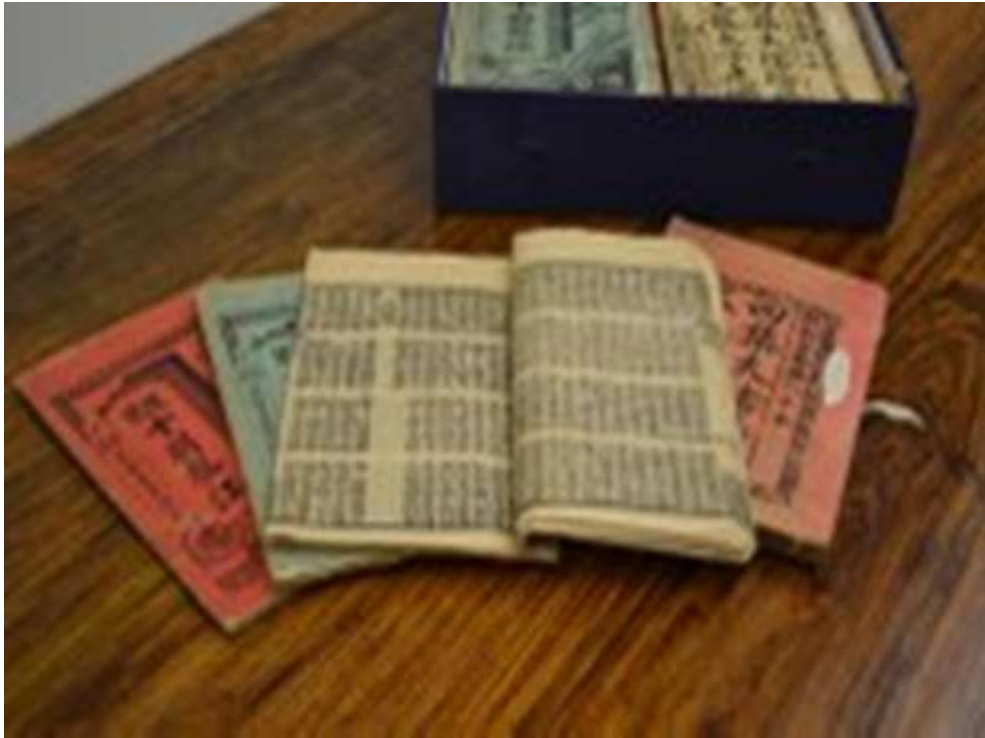
← Wooden Fish Books