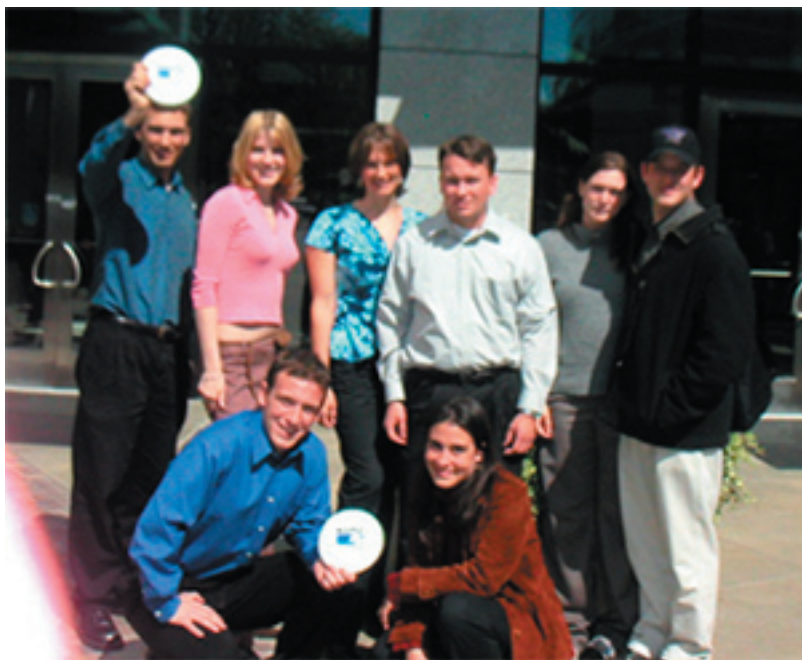
SEUS outside of the KOMO studios after appearing on Northwest Afternoon.