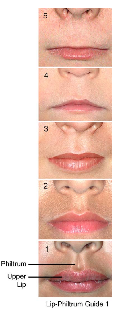
Fig. 1. Fetal alcohol syndrome lip-philtrum guide.

preadoptive review are not able to be accurately assessed with this software tool unless families have taken the photographs themselves. Before traveling to a child's birth country, parents may be prepared in advance to photograph a child accurately, with an internal measure of scale allowing for later analysis. Our clinic uses an office supply sticker of known width that is placed on the patient's forehead. A close-up photograph should be taken with the patient's unsmiling and relaxed face filling the entire frame. A digital 3-megapixel (or higher resolution) camera is ideal. The lens of the camera should be directly in front of the face (the "Frankfort horizontal plane") to minimize rotation of the face