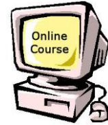
4-Digit Code Online Course (2005)