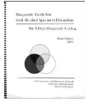
FASD 4-Digit Diagnostic Guide TM (2004)