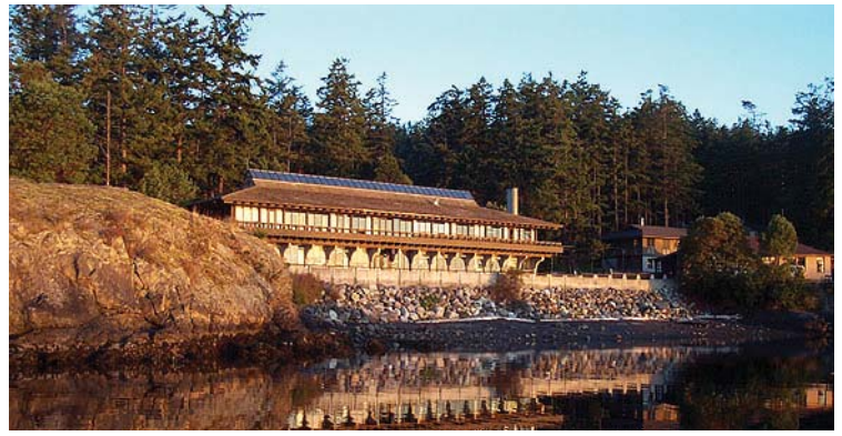
The Friday Harbor Laboratories are located on San Juan Island in Washington state, part of an archipelago that lies near the Canada-USA border. The town of Friday Harbor may be reached by scheduled airline service from Seattle, and by Washington State Ferries from Anacortes about 75 miles north of Seattle.

FHL endorses San Juan County's Marine Stewardship Area. FHL visitors are asked to assist in protecting fish and invertebrates through rigorous efforts to minimize harvest. At the end of a visit, FHL visitors are asked to return organisms to their original site or to pass them on to other scientists or students.