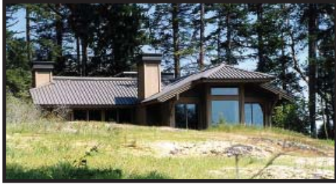
Whiteley Study Center

The Helen Riaboff Whiteley Center provides a retreat for established scholars and artists to study, write, create and interact with collaborators in a peaceful and stimulating environment. Scholars of any discipline may work at the Center for stays of several days to three months, undisturbed by the conflicting demands of their academic and artistic careers.