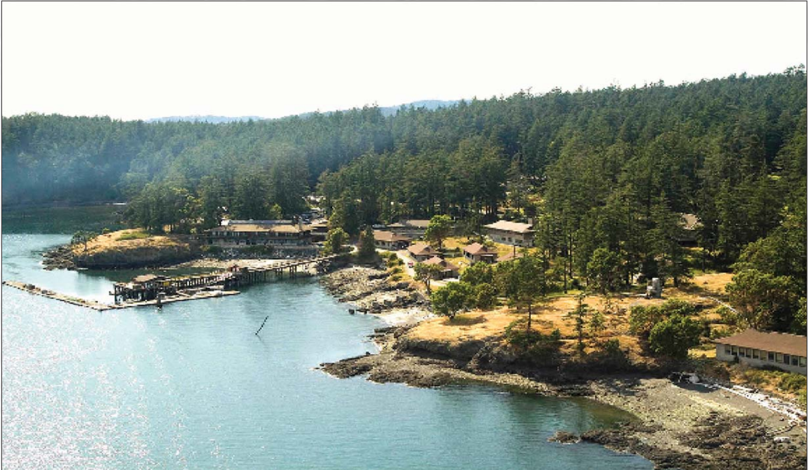
Friday Harbor Laboratories (K. Ballard) Front cover photo: cleared & stained embryos (A. Summers)