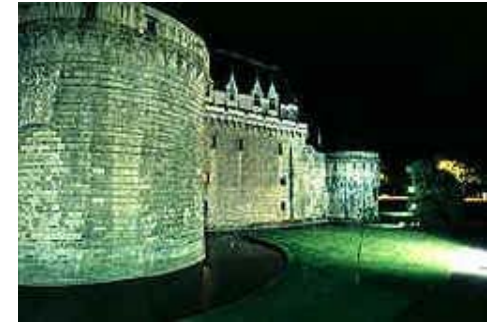
Castle of the Ducs of Bretagne in Nantes

Students should reference http://ipe.washington.edu for more information about Financial Aid & scholarships, including the quarterly IPE scholarship.