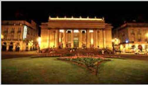
The Théâtre Graslin, Nantes's opera house

The minimum requirement for this program is French 103. The program is open to students of all levels beyond 103.