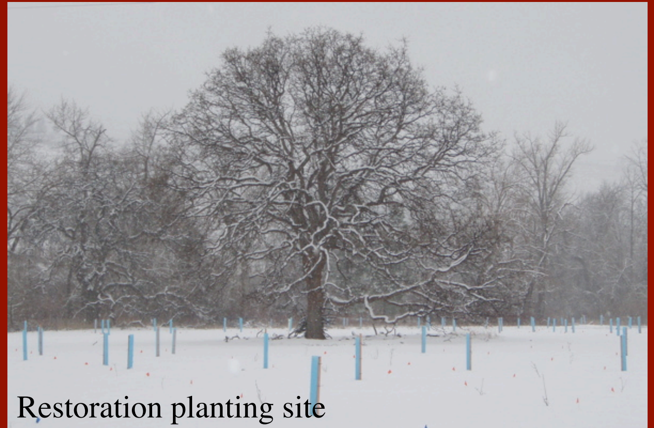
Restoration planting site