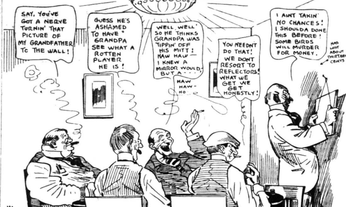
WELL HE THINKS SO HE THINKS GUESS HE'S ASHAMED TO HAVE "GRANDPA" SEE WHAT A MURDERER HE IS!