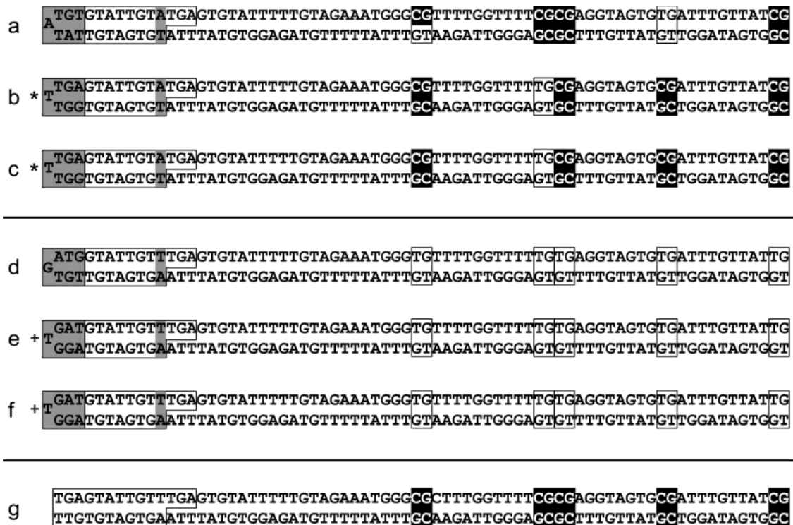
Figure 2. FMR1 promoter sequences, with inferred methylation states of CpG sites, recovered from male fragile X patients using hairpin-bisulfite PCR with linker barcoding and batch-stamping. Methods are as described in the text. Unconverted (methylated) CpG dyads are black, and converted (unmethylated) CpG dyads are boxed. Within the 26 nt linker (boxed region at left), the randomized 7 nt variable barcodes are shaded at far left; the designated variable batch-stamps (A:T or T:A) are shaded at right. All sequences show 100% conversion of non-CpG cytosines. (a) A distinctive hypermethylated sequence. (b and c) Redundant hypermethylated sequences recovered from independent bacterial colonies, with identical barcodes and methylation patterns. (d) A hypomethylated sequence with a distinctive barcode. (e and f) Redundant hypomethylated sequences with identical barcodes recovered from independent bacterial colonies. These are distinguishable as redundant and as different from the hypomethylated sequence 'd' only because of barcoding. (g) A contaminant sequence bearing our original hairpin linker that predates the addition of the barcode and batch-stamp. This sequence was recovered during analysis of the same sample that generated sequences 'a-c'. Sequences 'a-c' carry a different batch-stamp than sequences 'd-f', with the inversion of the A-T base pair, confirming that these sequence sets came from different DNA samples. Redundant hypermethylated sequences are denoted with asterisks (*), and redundant hypomethylated sequences with plus signs (+).

identifying contaminants and redundant sequences arising from template re-cloning. We have identified contaminant sequences even when multiple control (no DNA) PCR samples were negative. Barcoding allows for quantification of the relative abundance of genomic methylation patterns or polymorphic sequences by correcting for skewing that can arise from PCR amplification or the cloning of the products. The barcoding method thus provides a definitive solution to the problem identified by both Taylor et al. (2) and Millar et al. (4), in which multiple amplified sequences are derived from a single original molecule when template DNA is limited or of poor quality. The method also allows for the analysis of mutations arising during PCR amplification. Although our application described here involves the use of hairpin-bisulfite PCR for amplification of double-stranded DNA, the method can readily be adapted to single-strand PCR. Useful applications will include analyses of limited template DNA for biomedical, ancient DNA and forensic purposes.