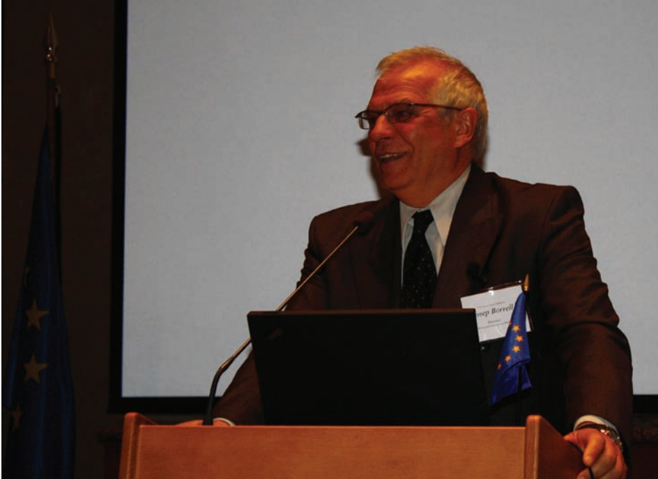
Photo: President of the European University Institute Josep Borrell delivers the 2010 West Coast Model EU keynote address on April 23.

In Celebration of the 2010 EU Spanish Presidency, the Centers Hold