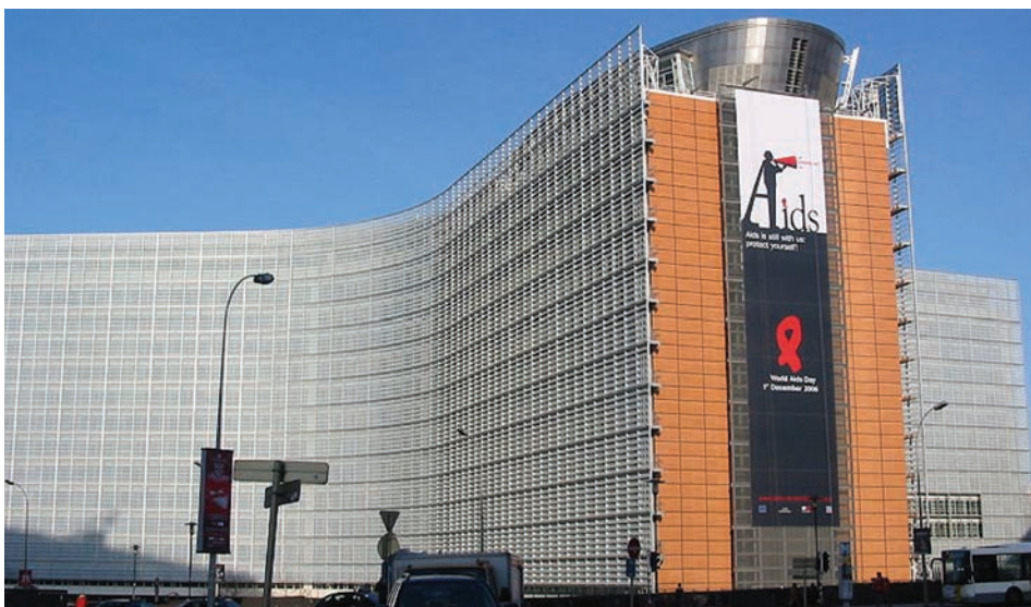
Photo: The Berlaymont building in Brussels, headquarters of the European Commission. Participants in our summer programs in Brussels will visit major EU institutions in the EU capital.

A large number of CWES and EUCE activities over the past six months have focused on the new Treaty of Lisbon and its impact on EU policymaking and the future direction of European integration. The full effects of the Treaty of Lisbon will only be felt and appreciated over time as implementation moves forward and the EU adjusts to new policies and procedures in a host of areas. Meanwhile, a new permanent President of the European Council and High Representative for Foreign Affairs have both taken office, and the European Parliament has confirmed a new European Commission.