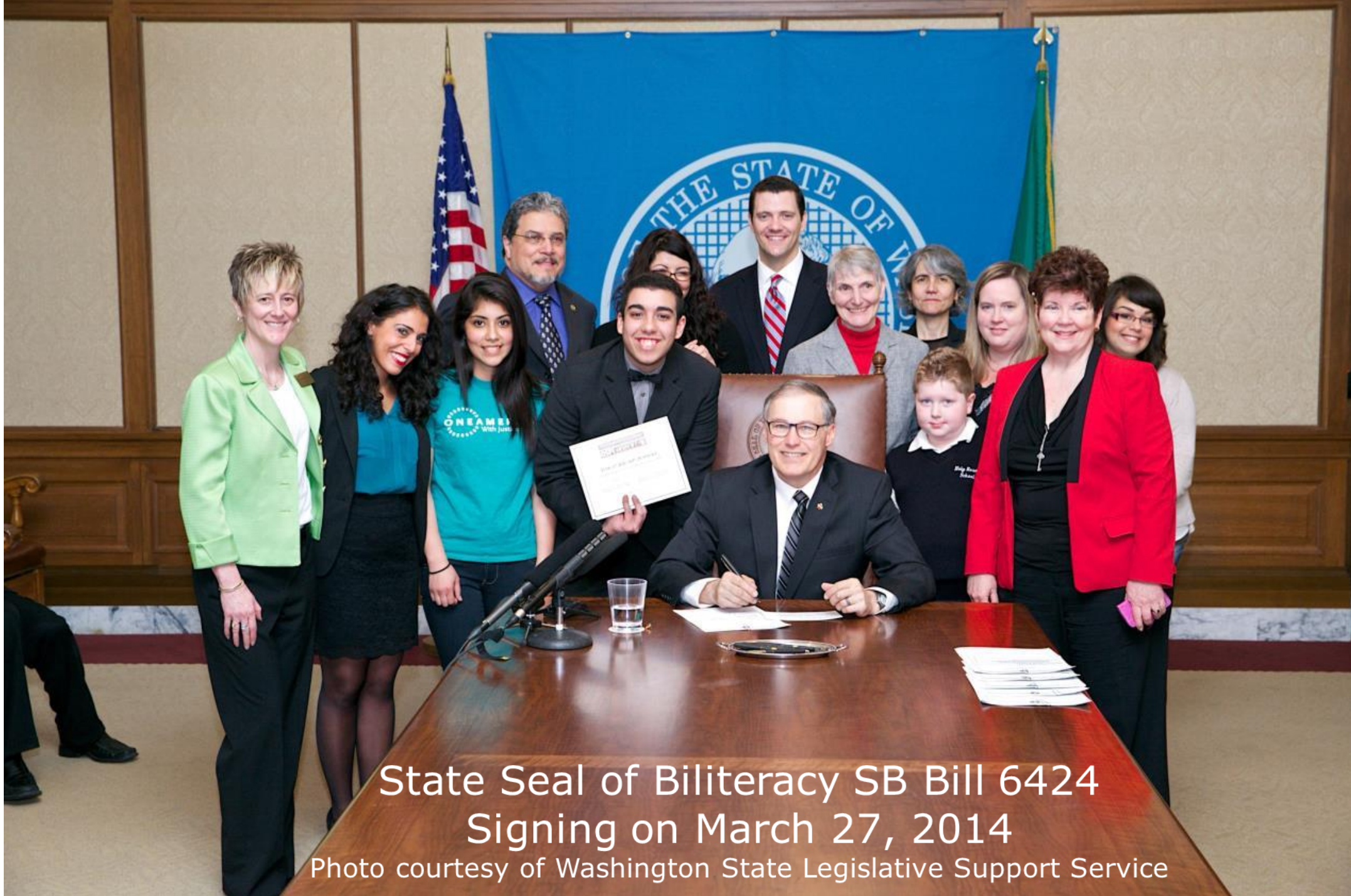
State Seal of Biliteracy SB Bill 6424 Signing on March 27, 2014