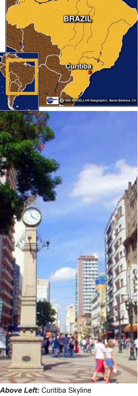
Above Left: Curitiba Skyline Above Right: Context Map Right: Rua Flores Pedestrian Street

In response to the influx of people, the mayor of Curitiba initiated a Master Plan design competition for the growing capital city. The winning team consisted of young idealistic planners and architects lead by Jaime Lerner.