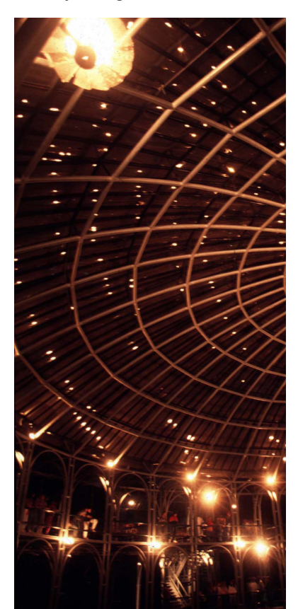
Inside Opera de arame (viaje.curitiba. pr.gov.br/opera5.jpg)

Recycled Materials were used to build the Opera House and old buses are turned into classrooms, daycare centers and clinics.