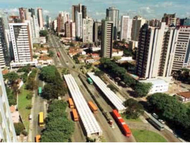
Dedicated Transit Lanes (garba.org/aboutme/pictures/curitiba)

Built in ridership (Income) through rezoning to encourage higher density along bus lines.