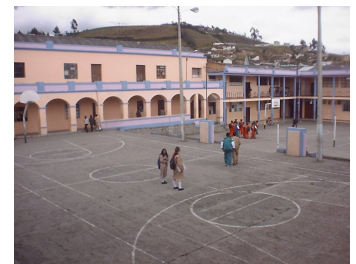
San Gabriel, Ecuador