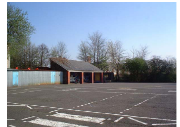
Whitechurch, United Kingdom

There are a number of reasons why school yards have had to adapt and accommodate more responsibilities as open spaces. The current state of shrinking amounts and sizes of open spaces in cities and urban areas has forced the reassessment of how school yards are designed, maintained, and what functions they provide. These play areas are now being asked to contribute to habitat space because there is a lack of open space in the most populated regions. But at the same time it creates an opportunity for children to understand and interact with ecosystems that they would otherwise never see. The epidemic of obesity and overall unhealthiness that is overwhelming our country has also forced playgrounds to do more than simply offer a place for children to run around, they must now also grow the nutritious foods necessary for children to eat healthy. School yards are also being asked to supply communal space for neighborhoods without access to major public parks. Sometimes it is in the form of a conscious decision to meet, for example at a neighborhood potluck or perhaps a park cleanup effort; other times it is an informal relaxed assembly of people who come to use the park for different reasons, someone walking the dog, a father and son playing catch, or maybe even people just looking for a quiet place to rest.