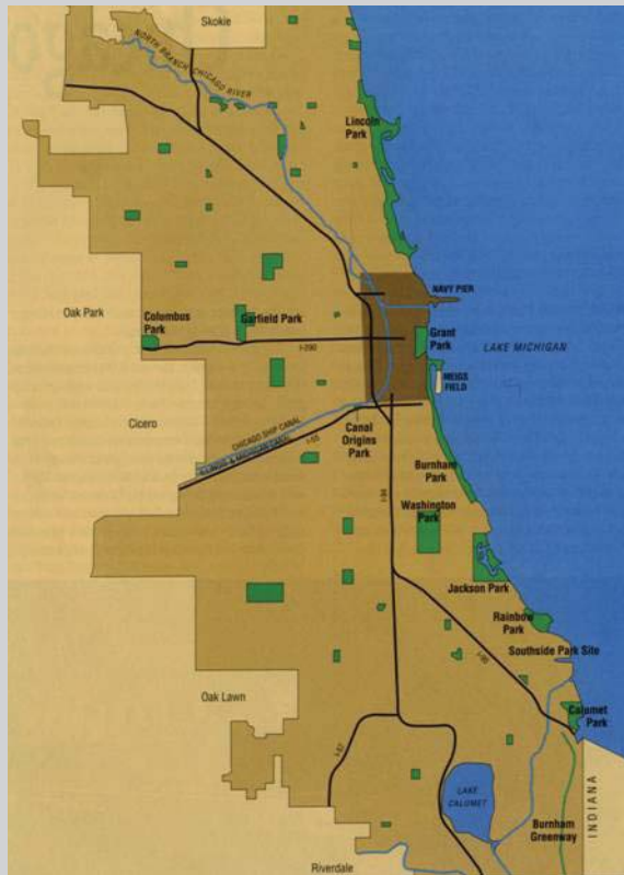
Diagram of Chicago Park System

Park Map System, Chicago.