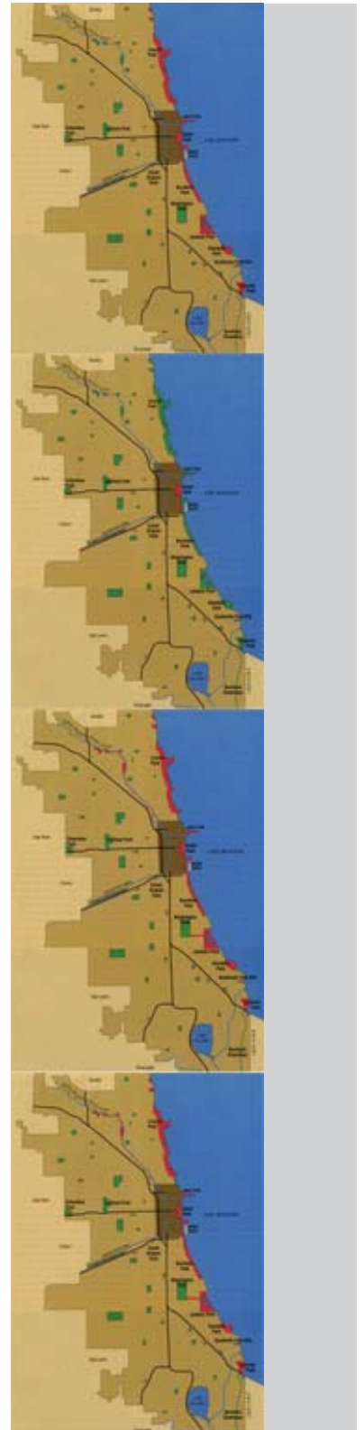
Park map system, Chicago. Modified from Harnik, 1997